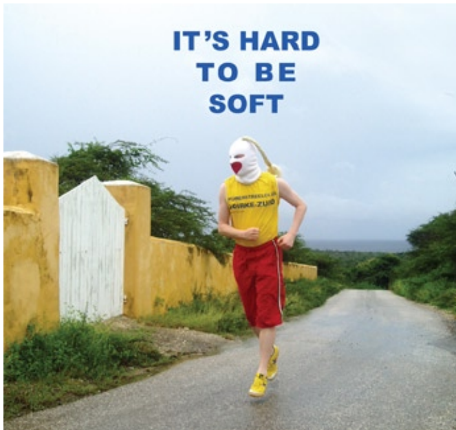
Y.O.W.I., It's hard to be soft, s.a.