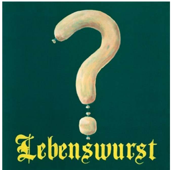
Y.O.W.I., Lebenswurst, s.a.

Library Van Abbemuseum Bilderdijklaan 10 Eindhoven, the Netherlands