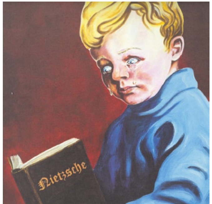
Y.O.W.I., Nietzsche, s.a.

The library of the Van Abbemuseum is known as one of the best specialist libraries in the Netherlands. It concentrates on scholarly literature in the field of modern and contemporary art. The interchange of knowledge is one of the Van Abbemuseum's main priorities, and it is an area where the library plays an important role. Under the heading of 'Library Exhibitions', the Van Abbemuseum library programmes exhibitions of work on paper, bibliophilic editions and artists' books, and collaborates with artists and with collectors and publishers of books.